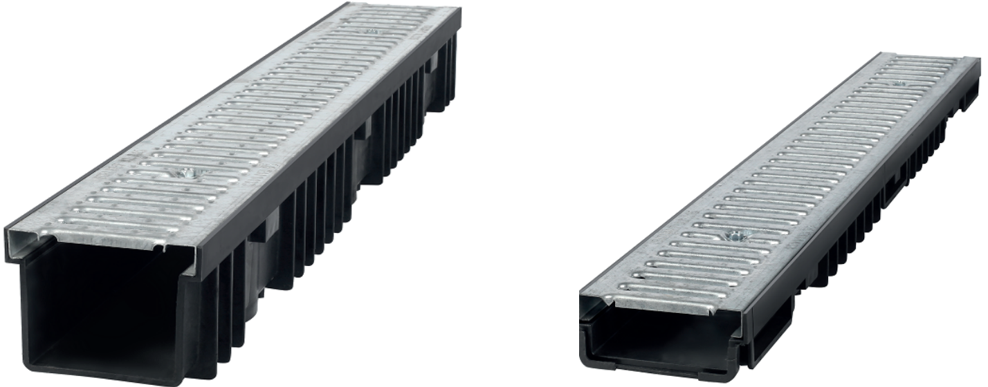
Technical sections of linear drain